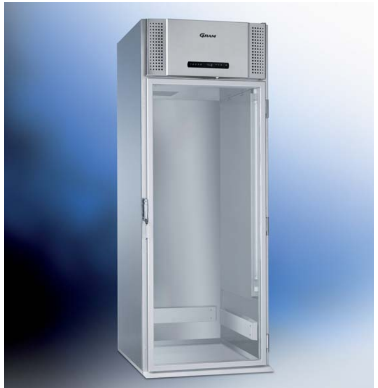
Roll-in refrigerator KG 1500 with glass door.

The cabinet is equipped with a sturdy handle with "positive" closing.